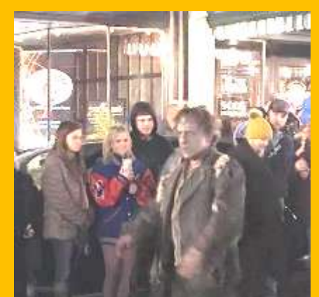
Folks were "Thrilled" to be on the streets in Harrodsburg Saturday night.