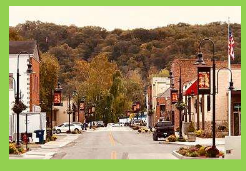
Watch for more exciting news from Beattyville soon!!